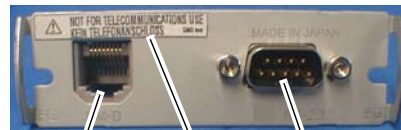
customer display connector caution label serial interface connector

The following view shows the part names of the UB-S09.